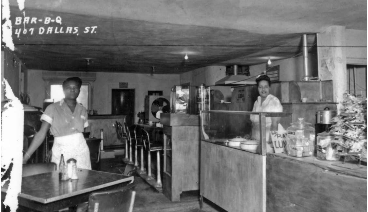
Bar-B-Q restaurant circa 1950s, located at 407 Dallas St.