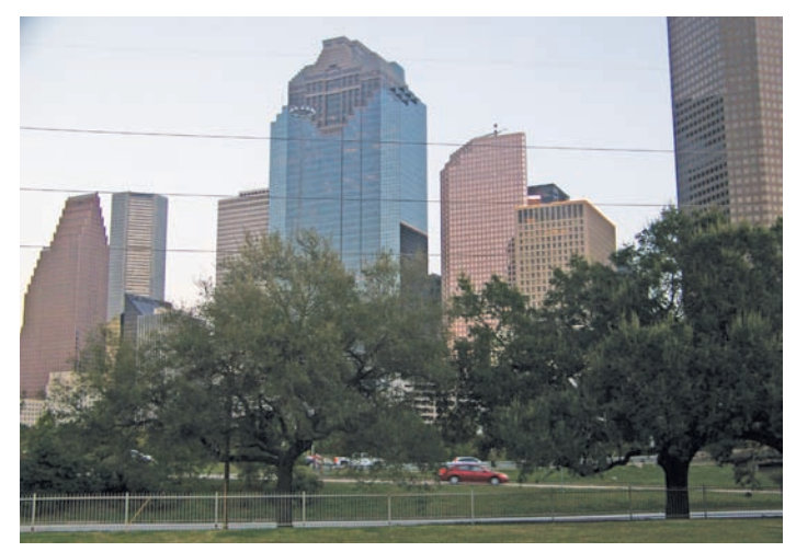
Cars hurry south on I-45, the Gulf Freeway, as downtown skyscrapers led by temple-topped Heritage Plaza stand sentry over the other world of Fourth Ward's Freedmen's Town.

Now, in the twenty-first century this is an ideal place to listen to the traffic on I-45, admire a stunning view of the Houston skyline, and contemplate the two worlds of the Fourth Ward.