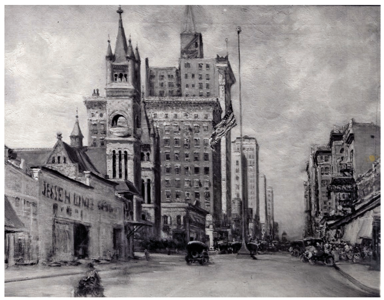
Looking north on Main Street from Lamar, the tower of the First Presbyterian Church is on the left in the Fourth Ward. Across the arbitrary boundary defined by Main Street is the Third Ward. This painting is based on a photograph taken in 1919.

Even before this influx of emigrants, former slave residents of Houston established what would become an important institution not only to Fourth Ward residents but to the city-wide African American community. Early in 1866, months after Texas emancipation, several African Americans met to establish their own Baptist church. The First Baptist Church invited the as-yet homeless congregation for their first service. The twelve members who attended welcomed seven new members who joined by baptism. The new Antioch Missionary Baptist Church later met in a brush arbor on the banks of Buffalo Bayou, and then in a frame structure at Rusk and Bagby. Antioch joined Trinity Methodist in Black church leadership.