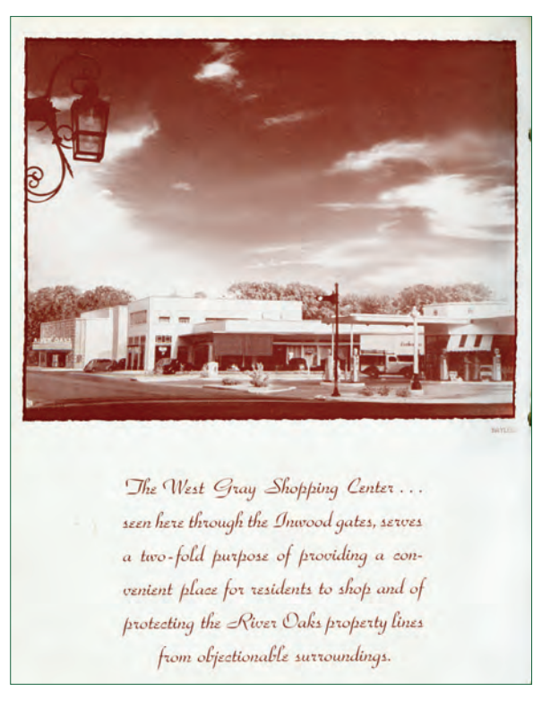
This ad, which appeared in the River Oaks Magazine in July 1939, spelled out the developers' intentions to protect the neighborhood. A similar ad for the theater itself described it as "Dedicated to discriminatory family taste and to the patronage of children. Designed especially for the community near which it was built."

In 1939, Interstate Theaters completed two new facilities in Houston. The first was the Alabama Theater, followed by the River Oaks Theater three weeks later. It opened on November 28, 1939, with the movie Bachelor Mother , starring David Niven and Ginger Rogers. Ads in the Houston Chronicle and the Houston Post welcomed the new theater and proclaimed its virtues as the city's "newest and safest neighborhood theatre," which appealed to the residents of a restricted-access community like River Oaks. To appeal to families, the local Monarch Cleaners offered all night services to those going to the theater. The Dallas firm of Pettigrew and Worley designed the building, and