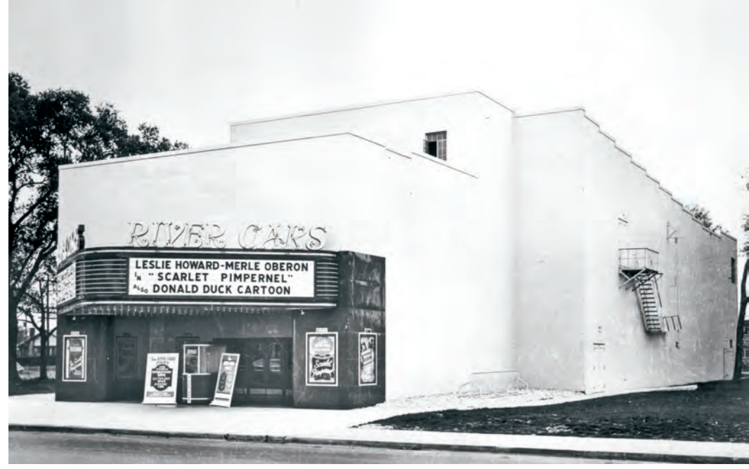
The theater as it appeared before construction of the adjacent shopping center in the 1940s. The developer advertised, "It sits, without electrical display or garish superstructure in a grove of tall oaks in perfect keeping with the neighborhood."

Despite all of the theater's accolades, in 2006 news leaked that Weingarten Realty planned to raze the River Oaks