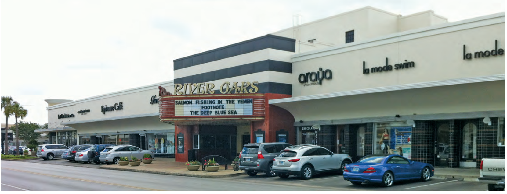
Today, the exterior of the River Oaks Theater and adjacent shopping center have a new look. The buildings have lost their characteristic Art Deco lines and color scheme to modernization.

the new structures, Weingarten hired the internationally renowned architectural firm Altoon and Porter, which has won several awards for renovation and historic preservation and works to maintain the cultural integrity of the community in its projects.<sup>13</sup>