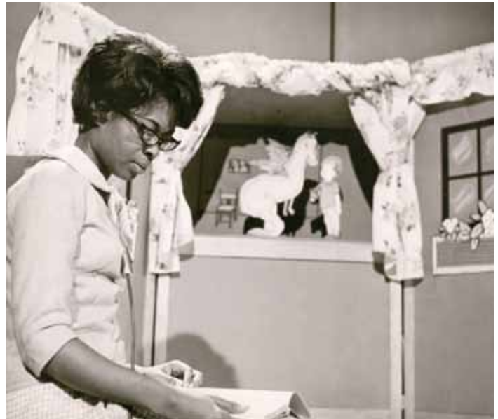
GRETA productions allowed KUHT to provide educational content for local children prior to the creation of the Public Broadcasting Service/PBS.