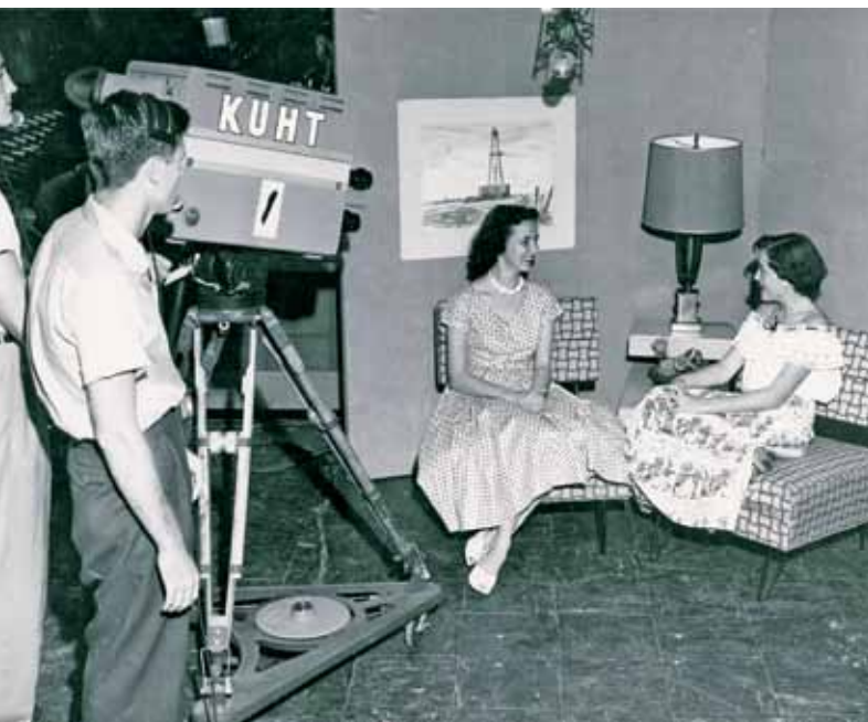
UH students shown as a camera operator, floor director, and on-air personalities for live KUHT broadcasts.