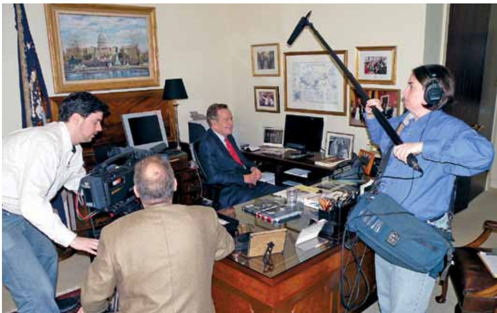
President George H. W. Bush was interviewed for KUHT's Berlin Wall Collection in 2011.

Technical advances and other industry-leading accomplish-