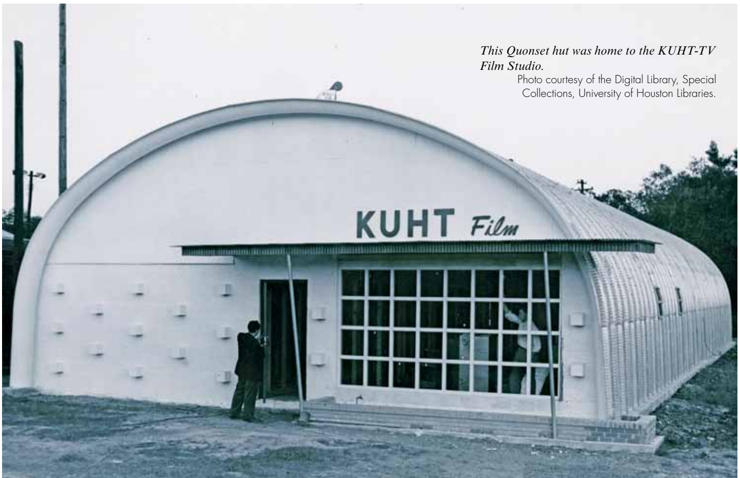
This Quonset hut was home to the KUHT-TV Film Studio.