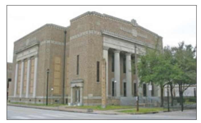
Built in 1925, Temple Beth Israel was designed for Finger's own Jewish congregation. Beth Israel used the structure until 1967. Today it serves as the Heinen Theater of Houston Community College.

Finger opened his own firm in 1923 and immediately began designing structures that boosted his reputation as one of Houston's finest architects. The first in 1925 was for his Jewish congregation, Temple Beth Israel. Its oversized columns create a larger-than-life feeling with a design inspired by ancient Egyptian architecture. Today the building serves as the Heinen Theater of Houston Community College with an unaltered exterior.