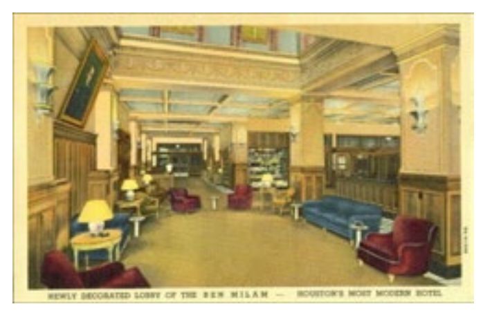
The interior of the Ben Milam Hotel exhibited the tremendous detail in Finger's work. In 2012, the Ben Milam, which had been vacant for decades, was razed.

All five of Finger's Houston hotel buildings remained until 2012. The DeGeorge is a center for veterans, and the Plaza on Montrose Boulevard adjacent to the Museum of Fine Arts is now a bank. Two still operate as hotels, the Auditorium Hotel under the name Lancaster, and the Texas State Hotel as Club Quarters. In December 2012, the Ben Milam was demolished to make way for upscale apartments.5