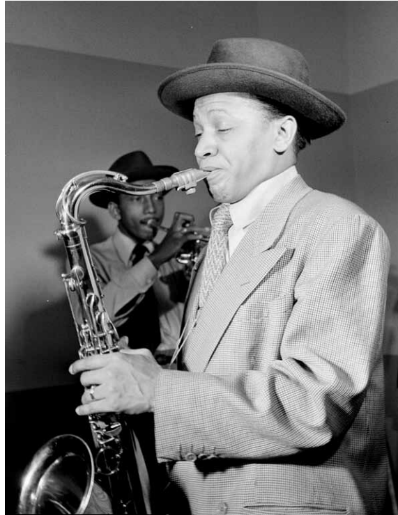
Illinois Jacquet played an instrumental role in changing racial attitudes through jazz music, which Norman Granz called "the music of democratic America."

Discussing his time in Houston during segregation, Jacquet recalled, "When I was here I didn't even know there was segregation in Houston until I would leave school or something and go downtown, and I'd see the signs because Phillis Wheatley was such a school [that] there was so much happening . . . they were winners in football team, basketball team, track. We had the best band at Phillis Wheatley, the better-looking girls, and they were light, just like white girls. They were black. They