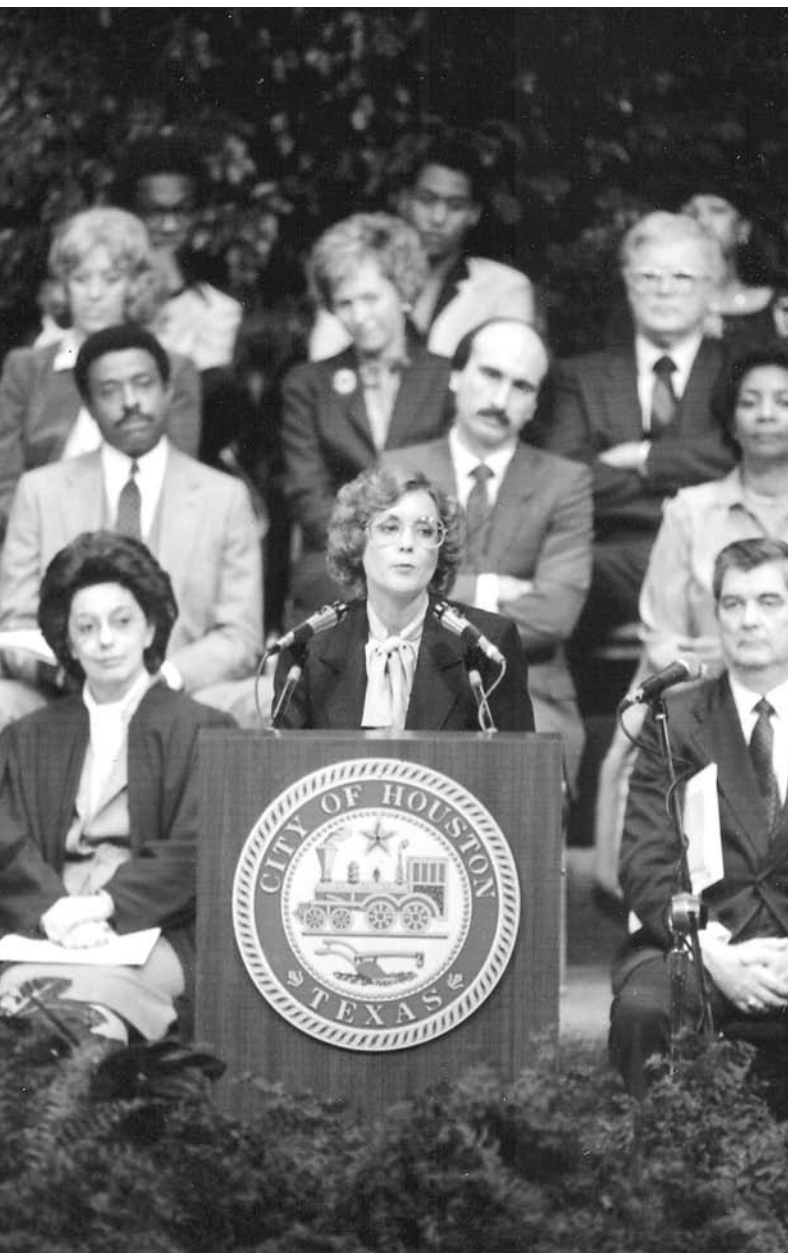
Mayor Kathy Whitmire at her inauguration in 1982. Despite criticism, she received the support of the GPC.

Photo courtesy of the Houston Metropolitan Research Center, Houston Public Library, Houston, Texas.