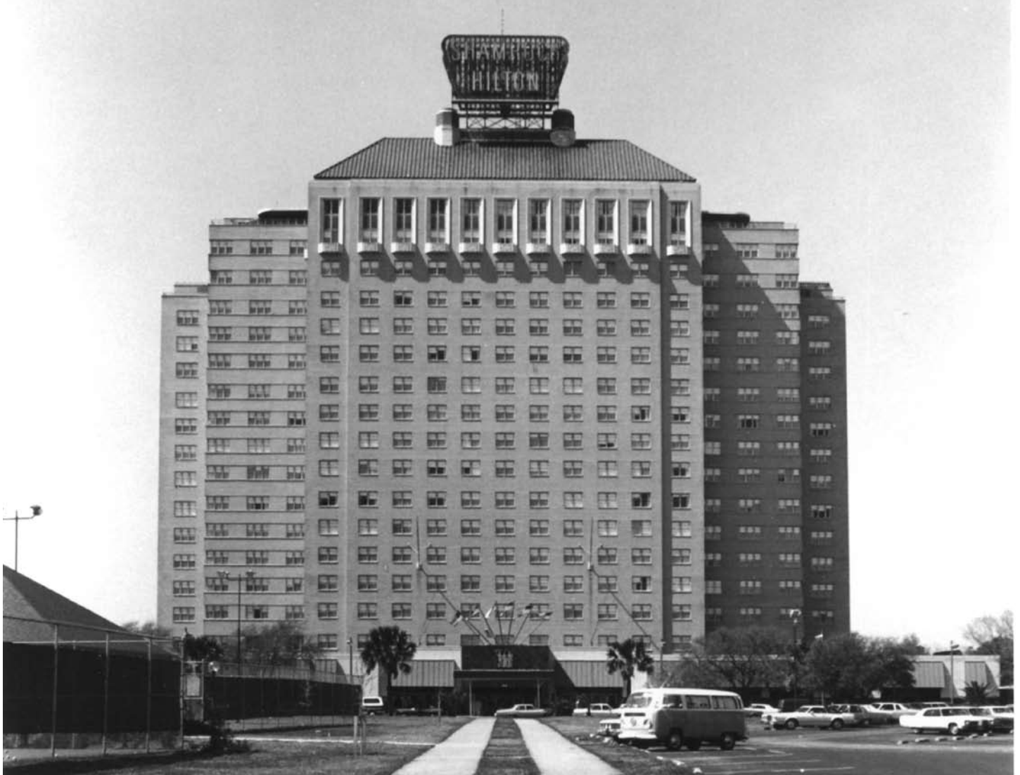
Shamrock Hotel, photo courtesy Metropolitan Research Center.

follow Main Street through the city and south where it turns into State Highway 90 as illustrated in the Houston Freeway Planning Map for 1949. 11