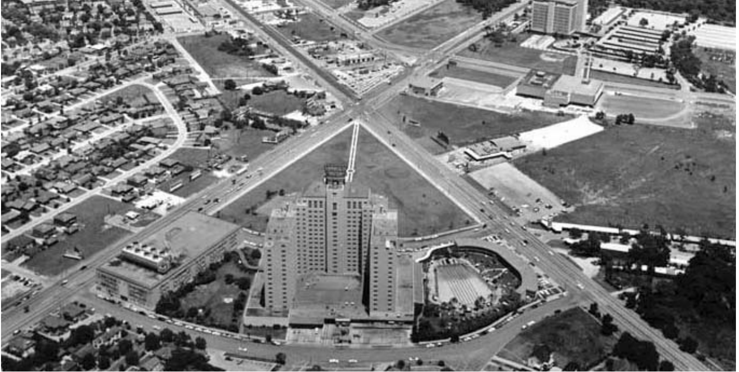
Shamrock Hotel

master of ceremonies for the evening was actor Pat O'Brien, and Dorothy Lamour's radio show broadcast was part of the entertainment for the party. The aspect of the grand opening that endeared the hotel to Houston was McCarthy's inclusiveness. Three thousand guests (including the Hollywood crowd) were invited to the party in the hotel and some 50,000 Houstonians showed up to watch the festivities. The evening evidently became so rowdy that an expletive was heard on the Lamour broadcast and the network cancelled the rest of the show. 19 The local newspapers dripped with stories about the stars, McCarthy, the hotel and anything related to it. Congratulatory ads took up entire pages, and regular ads identified their product with the hotel, capitalizing upon the event. 20 The Shamrock's grand opening was one of its finest hours.