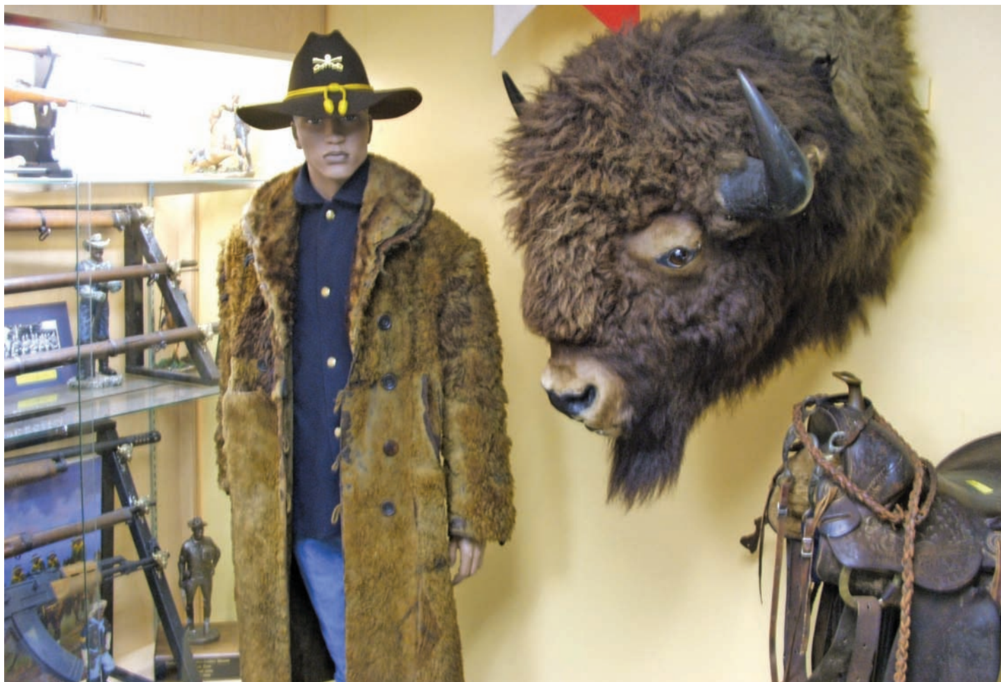
Artifacts in the museum include a display case containing firearms used by Buffalo Soldiers from all eras, an overcoat made from the hide of a buffalo, a taxidermy buffalo head, and a McClellan saddle of the type used on the western frontier.