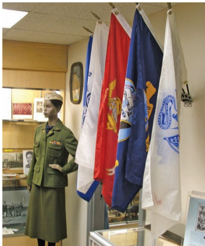
Flags of the armed forces are displayed alongside a World War II uniform worn by a female Buffalo Soldier.

The museum has a display dedicated to the African American astronauts who traveled into space or were lost in the effort of exploration. When asked why this group is included in the display, Capt. Matthews quickly pointed out that “they are modern day Buffalo Soldiers,” but that is not the only reason. “To be able to get students engaged, you’ve got to bring them from one era to the current era to make it all real. . . . They have