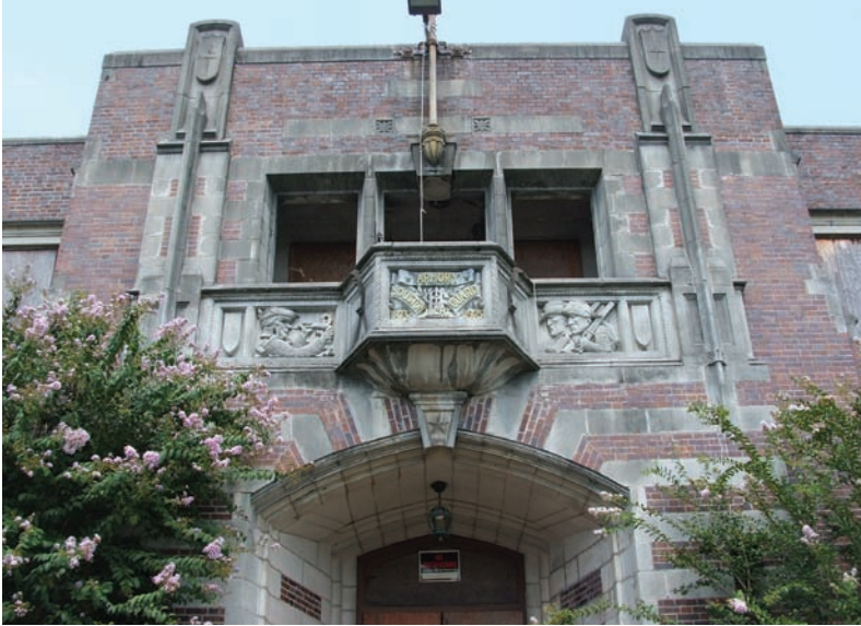
A close up view of the entrance at the Houston Light Guard Armory, the future home of the Buffalo Soldiers National Museum.

Guard, the armory building funds were raised through drill competitions in the 1880s and 1890s, and more than a century later, have given the Buffalo Soldiers Museum the foundation for a new home.