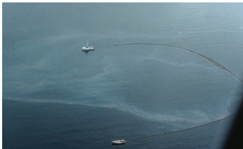
Oil skimming operations in Prince William Sound.