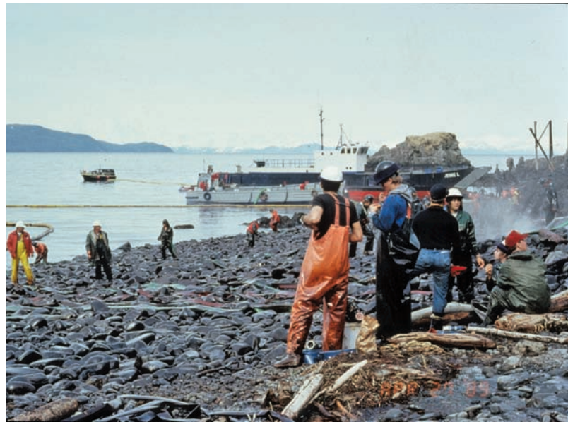
High-pressure steam-cleaning the beaches of Prince William Sound.