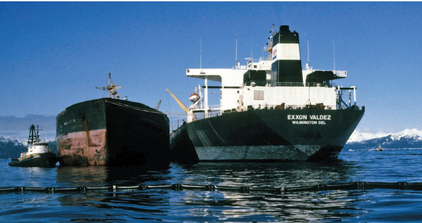
Exxon Valdez transferring crude to the lightering ship, Exxon Baton Rouge, Prince William Sound, Alaska, 1989.

BN: I think the magnitude of the spill was the driving force behind the Oil Pollution Act of 1990 and its amendments. I say “amendments”—the Oil Pollution Act of 1990—if you look at it, it is as a series of amendments to a large number of existing statutory provisions that were already in effect. The main liability provisions, the proof