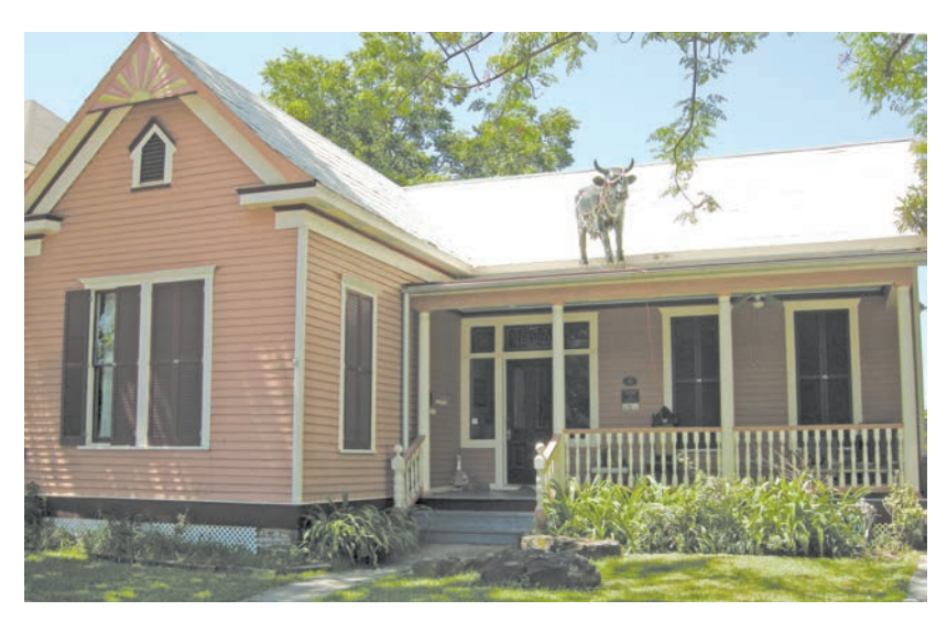
The Beazley-Telschow House, built in 1888 on Kane Street, is an L-shaped Folk Victorian home that has seen many add-ons over the years. The Old Sixth Ward Historic District Neighborhood Association notes that the cow on the roof "does not alter the architecture of the house and as such, does not violate the historic preservation ordinance."

Increased population of French, English, Germans, North Americans, a few Spanish, and many free Blacks began to settle in clusters around the town. Between 1836 and 1860 came the largest migration to Houston from overseas. Although Germans continued to travel through Houston during the 1840s and 1850s, many stayed, joining 6,000 Germans by 1847. The Fourth Ward north of