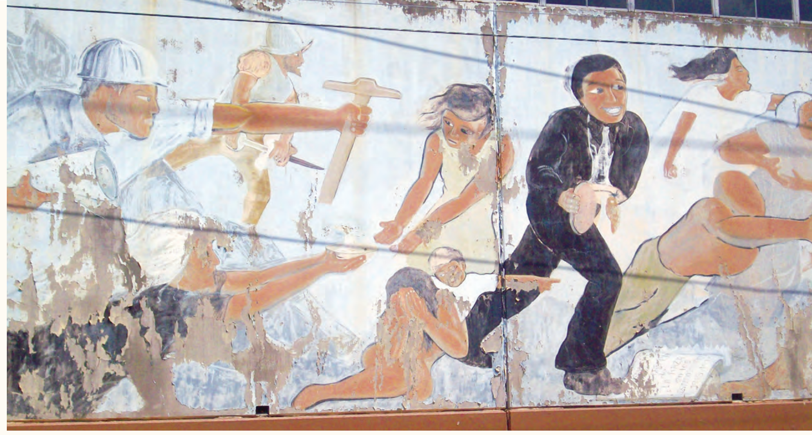
This is one segment of the Canal Street mural that was created by Leo Tanguma. Approximately 240 feet in length, the mural is Houston's best-known example of Chicano | Latino | Mexicano public art and an important statement about the struggles faced by Mexican Americans.