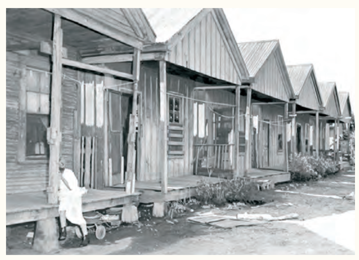
Residents of the El Alacrán barrio, known originally as Schrimpf's Field, dealt with dilapidated housing conditions following the departure of the area's early German residents.