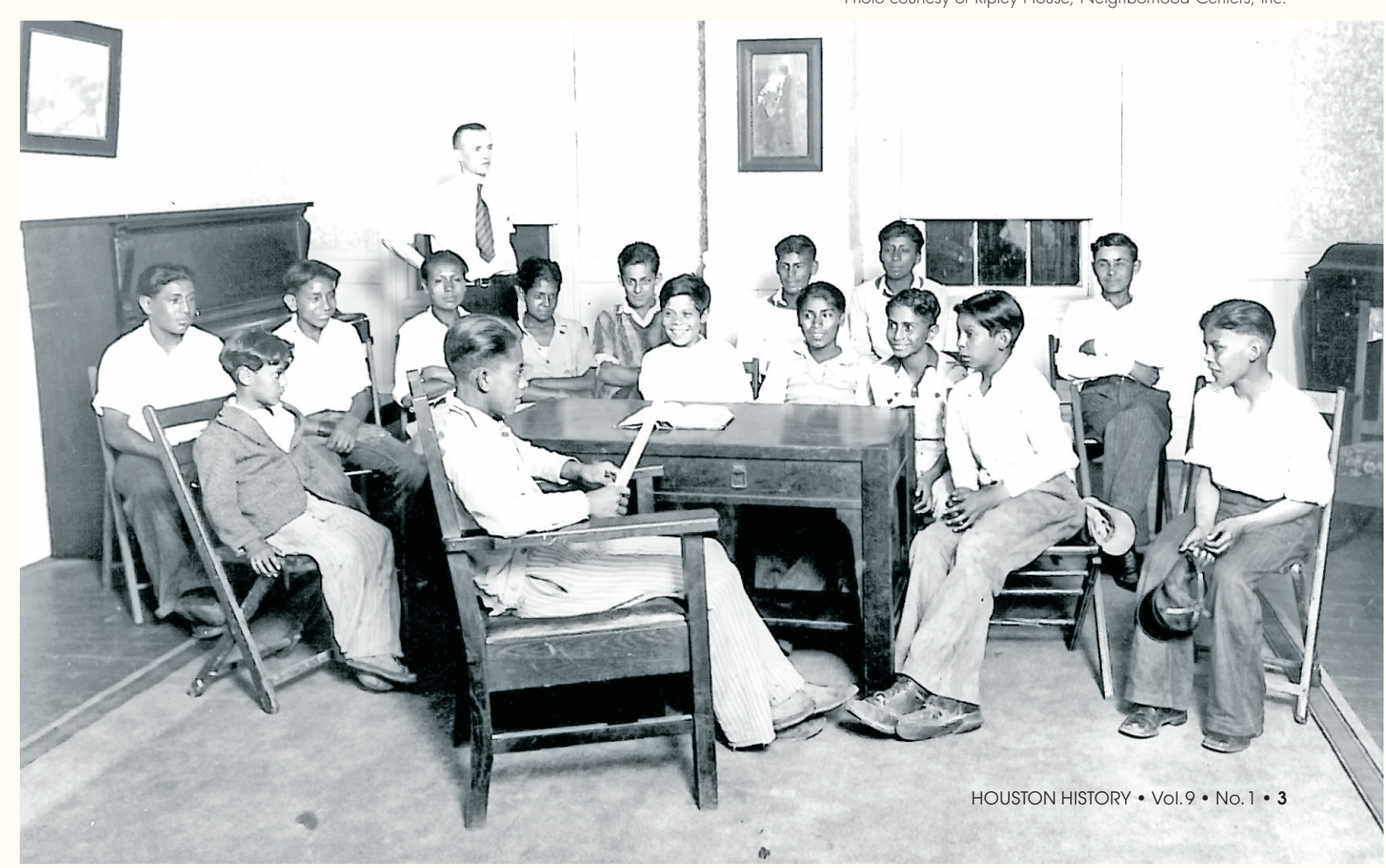
Rusk Settlement House and School provided educational opportunities for Mexican American children in the neighborhood.

Constructed in 1911 in Second Ward, Our Lady of Guadalupe Church is considered the first Mexican American church in Houston and the first religious institution to offer services in Spanish. It provided food and shelter and ran one of the earliest schools for Mexican American children. In the 1920s, the Immaculate Heart of Mary Catholic Church opened and with this second church, Mexican Americans now had multiple institutions to serve their spiritual and personal needs. Established in 1907, the Rusk Settlement House provided food and shelter, helped people apply for residency or citizenship, and provided