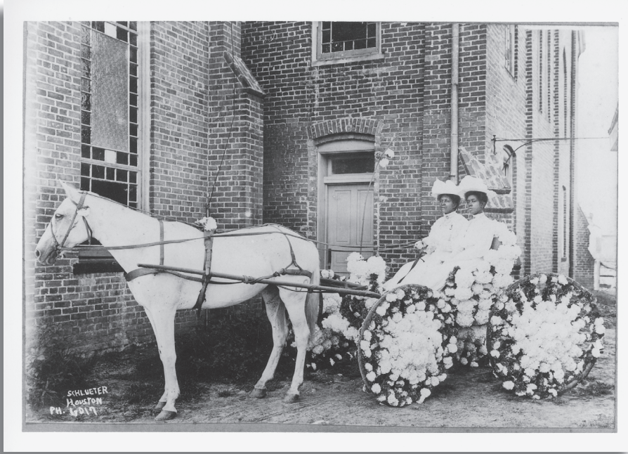
Throughout the decades after emancipation, up until present day, Houston residents celebrated Juneteenth by participating in parades, even elaborately decorating buggies, as seen in this turn of the century photograph.

Congress would not allow the seceded states back in the Union without some guarantee of black political and civil rights and assur-