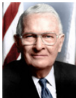
Texas governor Bill Clements was aware of and urged continuation of SMU’s pay-for-play plan for SMU football players in the 1980s.

One of the major reasons for the break-up of the conference was the departure of the University of Arkansas to the Southeastern Conference (SEC) in 1991. Arkansas’s departure meant the SWC lost its only media market outside of Texas. The all-Texas conference drew only regional interest and smaller crowds, which limited the schools and the SWC’s media contract negotiations.