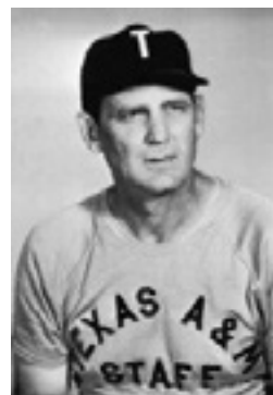
The NCAA placed Texas A&M on probation for recruiting violations in 1957 when Paul "Bear" Bryant served as head coach of the football team.

One of college football's worst-kept secrets was the age-old tradition of boosters trying to persuade recruits to consider their school. Usually the way the system worked was that the head football coach went to a recruit's house and tried to sell the recruit on the positives of the university and the success of its football program. If the coach could not get the recruit to sign during the visit, boosters tried to seal the deal, usually offering the