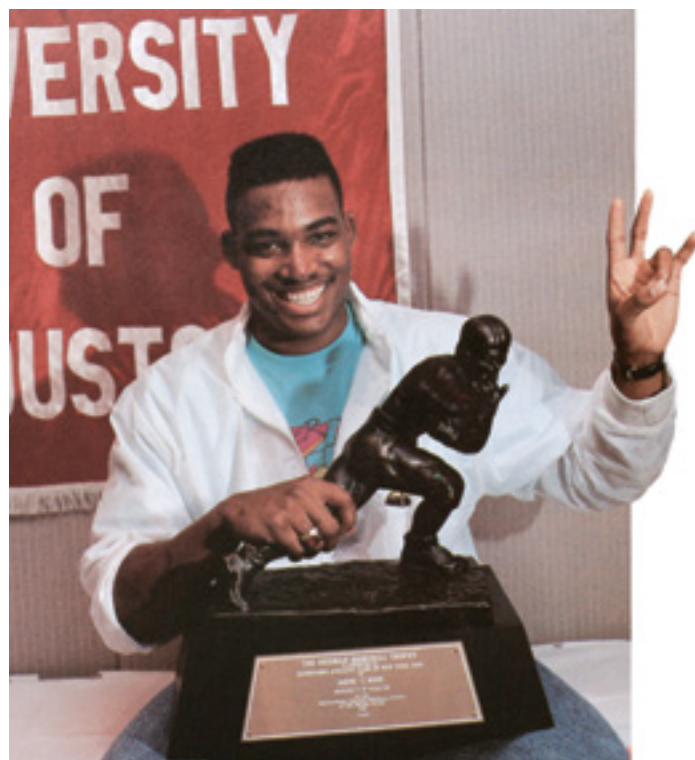
Despite the UH Cougars being subject to NCAA sanctions that kept them off of national television, quarterback Andre Ware won the Heisman Trophy in 1989.

In addition to limited media exposure caused by sanctions, the schools were not always the only game in town. TCU and SMU stood within an hour of the Dallas Cowboys; Rice and the University of Houston pulled from the same fan base as the Houston Oilers. Over the decades, the emergence of the Dallas Cowboys and Houston Oilers robbed the SWC’s four schools in Dallas/Fort Worth and Houston of their game-attending fan