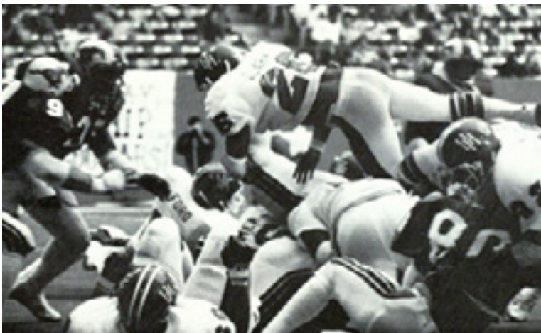
In 1981, UH upset SMU 13-11, but SMU went on to win the conference in 1981 and 1982. In 1984, the two schools shared the title.

money to attend Texas A&M. Corruption became so common in the old Southwest Conference that at one point newspaper reporters called the conference “The Old West,” referring to teams getting away with anything and facing minimal repercussions from the NCAA for their actions. In the 1980s, however, all of the schools except Arkansas and Rice served some type of probation, for a series of booster-related scandals of which school personnel were not only aware but involved. 10