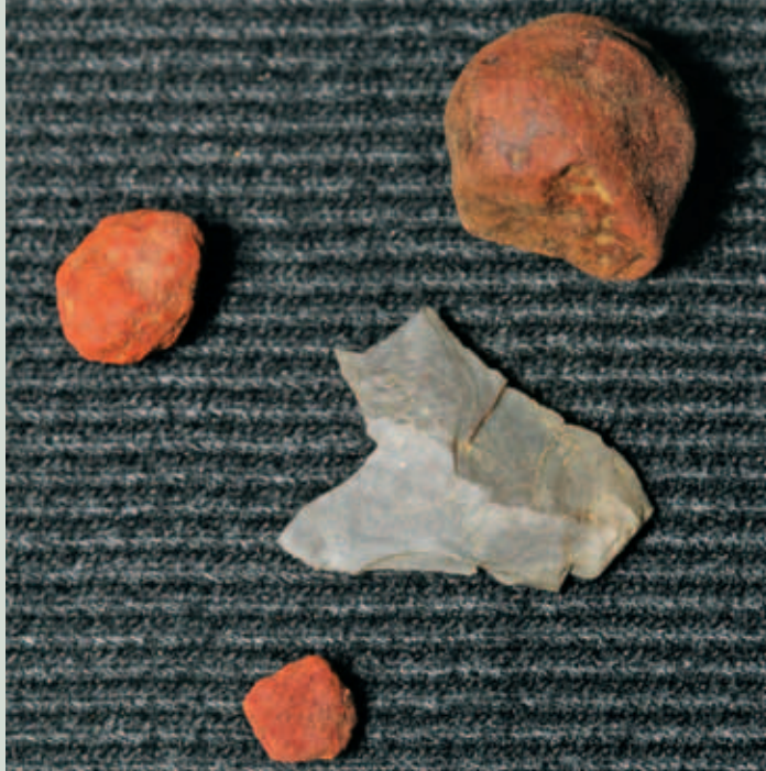
Evidence of earlier residents, the sharpened tool and red ochre pottery pieces were excavated on June 27, 2002, within a power line easement very close to what are considered to be the “Springs of Santa Rosa.” These items are held at the Jesse Jones Nature Center.

The Spring Creek area has a fascinating history. At its juncture with the San Jacinto River lay the tribe of Canos, an Orcoquisa tribe (others later spelled this Akokisa) made up of two villages on the Montgomery side of Spring Creek directly across from the modern site of Jesse Jones Nature Center, the 300-acre Harris County Precinct 4 Park. The Orcoquisa were, and still remain, one of the most unknown