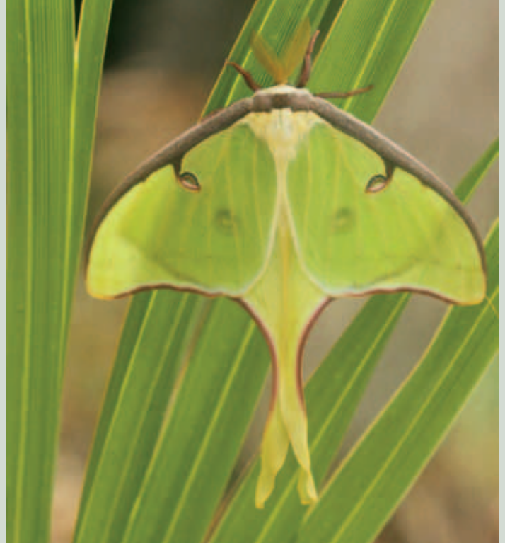
Luna moths are one of the largest moth species in North America and can be found around their necessary host plant species, sweetgum trees, along the Spring Creek Greenway. Males can be identified by their feathery antennae, which help them pick up female chemical cues.