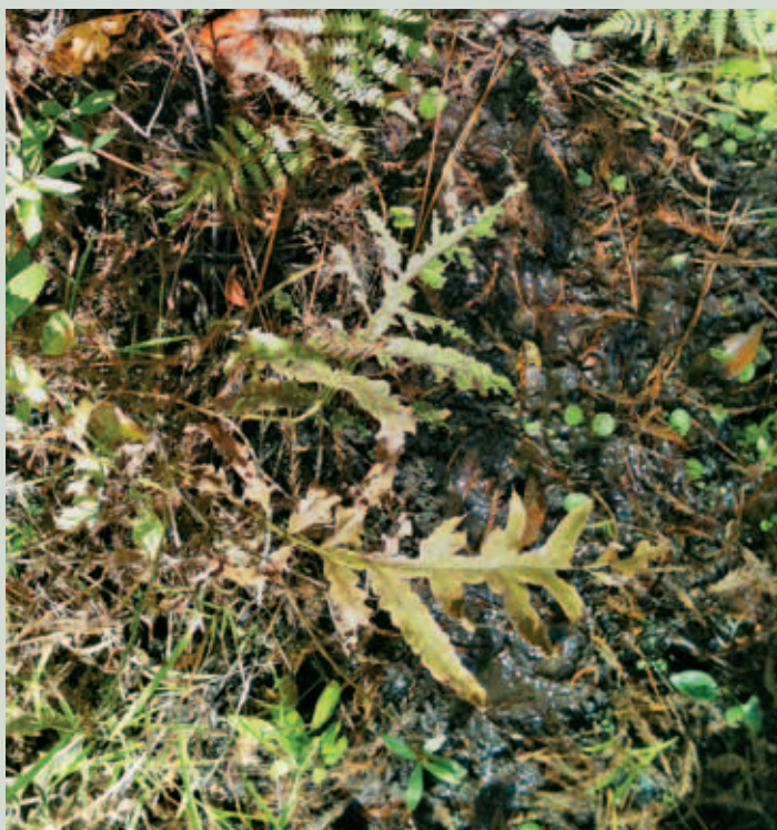
The purported “Springs of Santa Rosa.” In the middle of the photo are sensitive ferns and the top and top right are woodferns around this clear seepage area located directly northward across Spring Creek from Jones Nature Center.