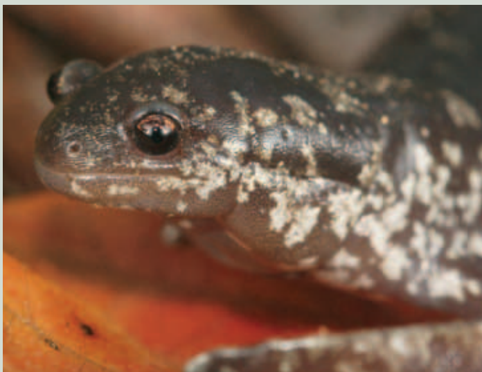
Smallmouth salamanders are sensitive to pollution and poor water quality. That they persist in the seasonally flooded wetlands adjacent to Spring Creek is a testament to the quality of its waters.

In my thirteen years working with Bayou Land Conservancy, landowners have granted me access to some amazing privately- and publicly-owned lands in the Houston region. Exceptional biologists and naturalists who specialize in various areas, including mushrooms, birds, amphibians,