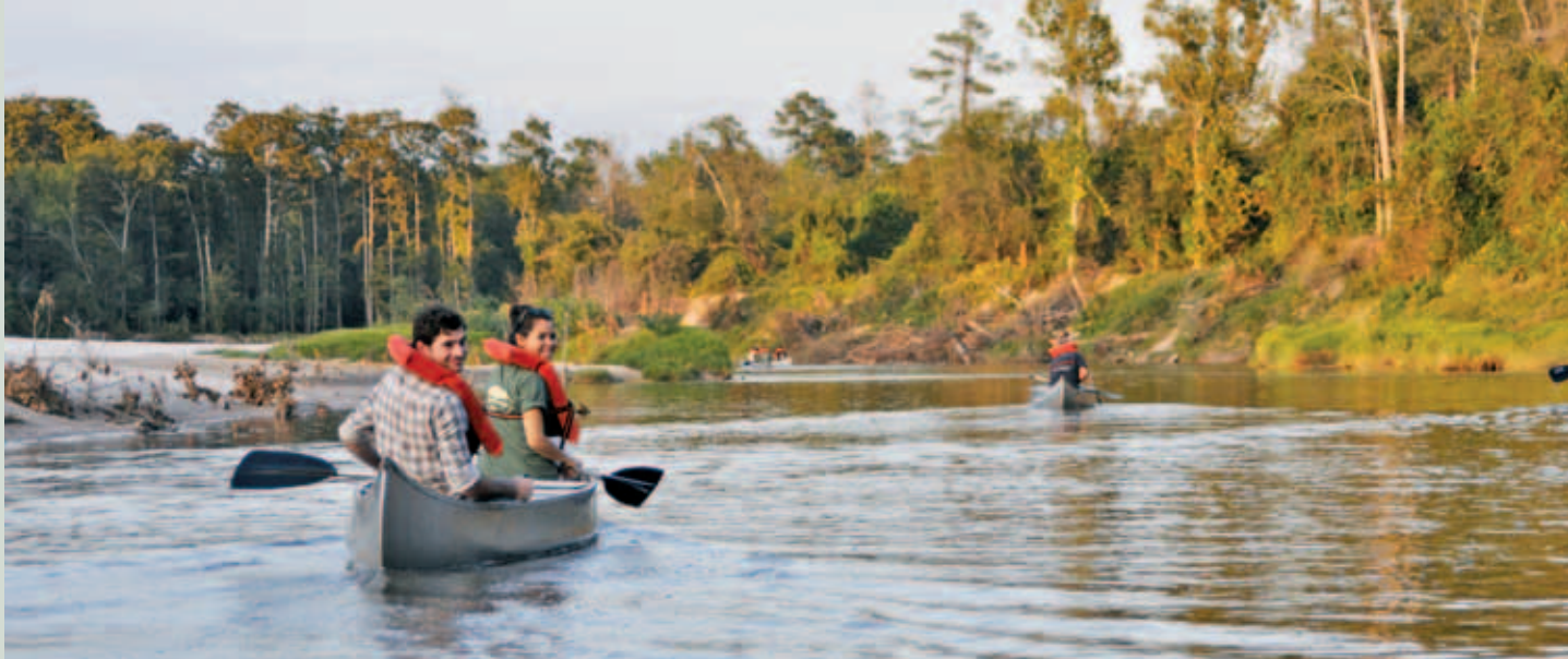
Paddlers enjoy quarterly canoe / kayak trips of Bayou Land Conservancy on Spring Creek, passing white sand beaches and centuries-old trees.