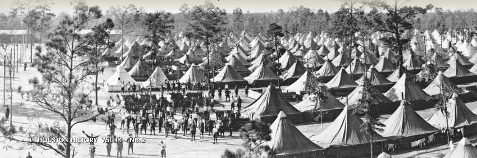
Photo courtesy of the Houston Metropolitan Research Center, Houston Public Libraries, MSS0481-001.