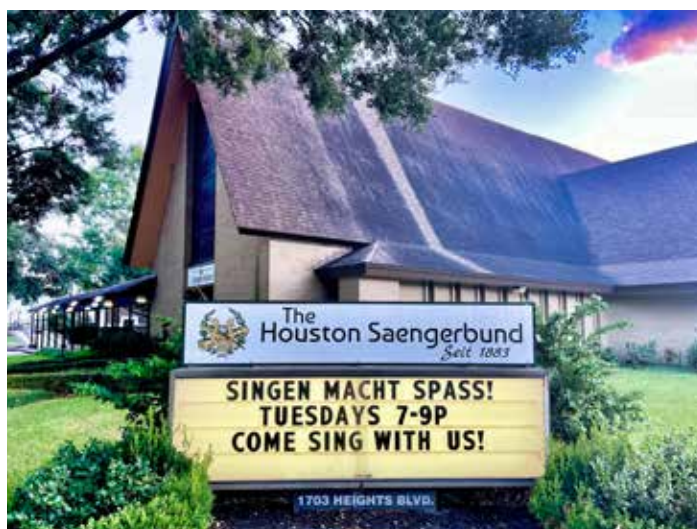
The Saengerhalle, located at 1703 Heights Boulevard, is home to wonderful events such as the group's Frühlingskonzert (Spring concert), Oktoberfest , and Weihnachtskonzert (Christmas concert).

Balancing the diversity of the membership while maintaining its German roots is something the group is mindful of, and has done successfully. In rehearsals, the Saengerbund tries to use as many German phrases as possible, as well as when they are at the Saengerbund Haus. The organization includes a Language and Culture Committee that