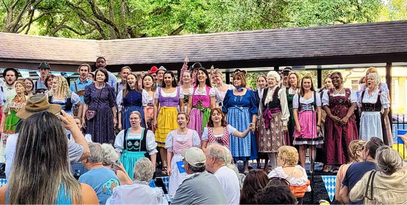
Members of the Houston Saengerbund host Oktoberfest at their new headquarters, located in the Houston Heights, in 2023. They spent time throughout their season practicing for the event, which celebrates their German heritage.