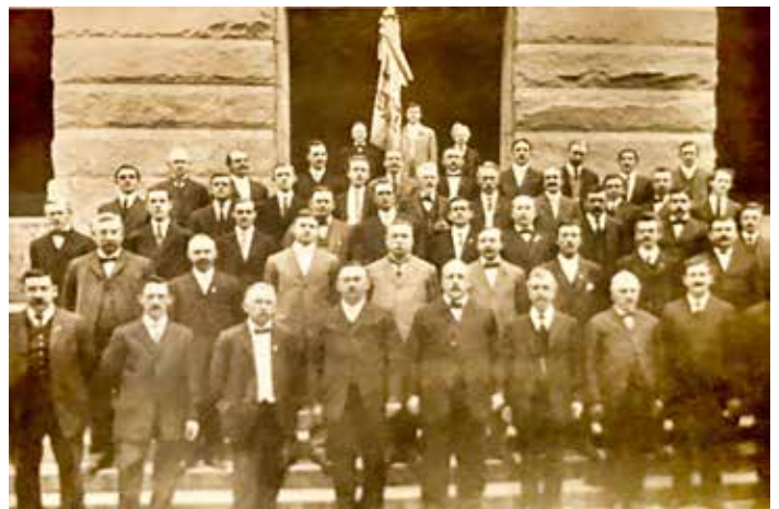
Founded in 1883, the Saengerbund is one of Houston's oldest music societies. It began with the Maennerchor (men's choir), shown here in 1913.

In 1938, the Houston Saengerbund established the Damenchor (women's choir), as prior to that date women had been excluded from singing in the Houston Saengerbund. Although choir men and women worked together harmoniously, one female club member described the gender dynamics of the club as more separated. "We have our meetings and they have theirs," she said with some amusement. "The men, they talk for hours and hours; they argue about things. The ladies, we get our meeting done with and we're out. We are waiting for coffee and cake. We always have coffee and cake!" 8