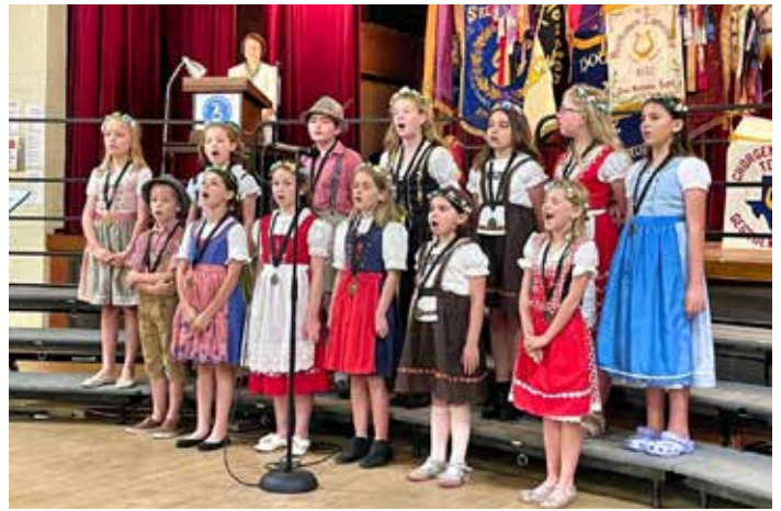
The Houston Saengerbund Kinder Choir performs at the 2023 Staatssängerkonzert . Photo courtesy of the Houston Saengerbund.

Photo courtesy of the Houston Saengerbund.